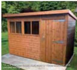
10' x 6' Malvern Heavy Duty Pent in 13mm Redwood with chrome fittings