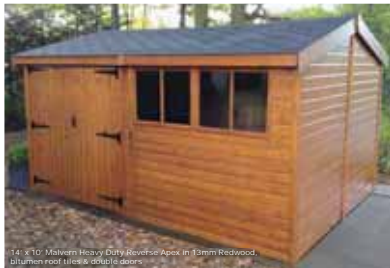
14' x 10' Malvern Heavy Duty Reverse Apex in 13mm Redwood, bitumen roof tiles & double doors