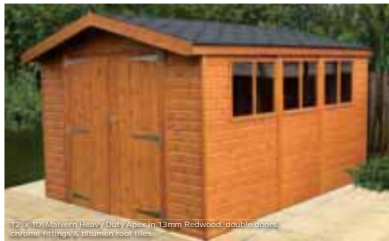
12' x 10' Malvern Heavy Duty Apex in 13mm Redwood, double doors, chrome fittings & bitumen roof tiles