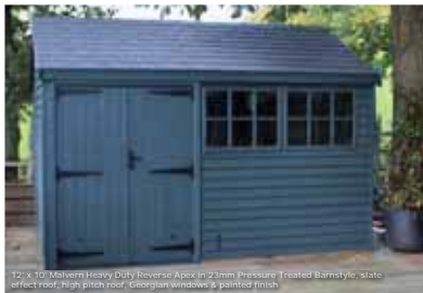
12' x 10' Malvern Heavy Duty Reverse Apex in 23mm Pressure Treated Barnstyle, slate effect roof, high pitch roof, Georgian windows & painted finish