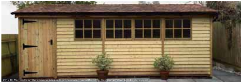
20' x 10' Malvern Heavy Duty Reverse Apex in 23mm Pressure Treated Barnstyle, Georgian windows & cedar shingle roof