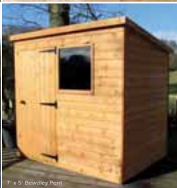
7' x 5' Bewdley Pent