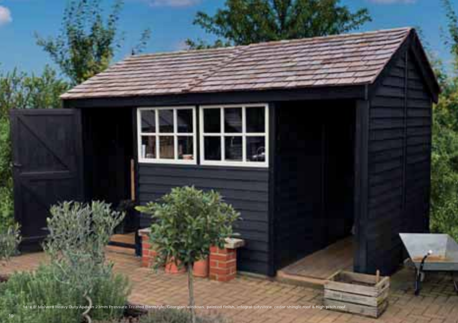
14' x 8' Malvern Heavy Duty Apex in 23mm Pressure Treated Barnstyle, Georgian windows, painted finish, integral tidystore, cedar shingle roof & high pitch roof