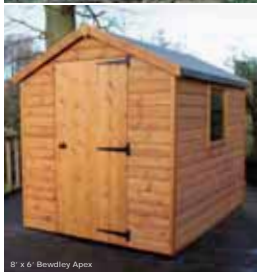
8' x 6' Bewdley Apex