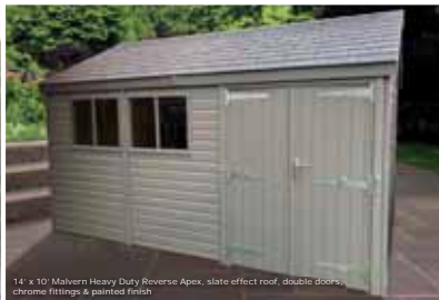
14' x 10' Malvern Heavy Duty Reverse Apex, slate effect roof, double doors, chrome fittings & painted finish