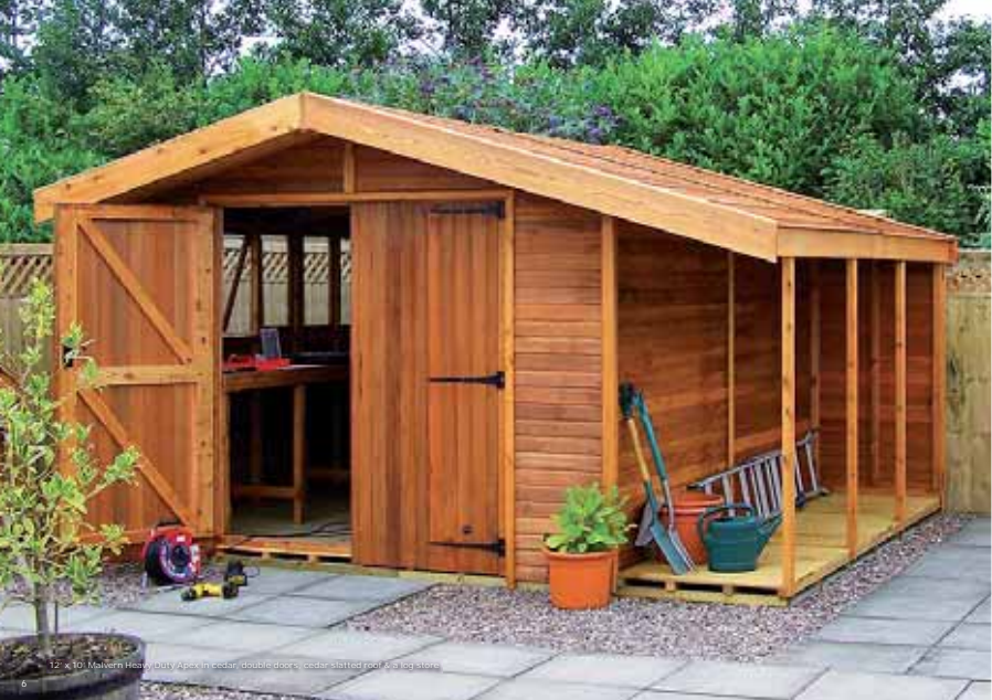
12' x 10' Malvern Heavy Duty Apex in cedar, double doors, cedar slatted roof & a log store