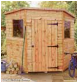
7' x 7' Bewdley Corner