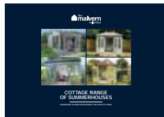
Cottage Range of Summerhouses