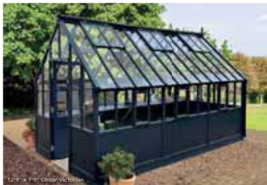
12'9" x 7'9" Cedar Victorian