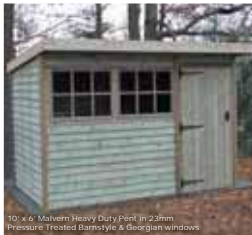
10' x 6' Malvern Heavy Duty Pent in 23mm Pressure Treated Barnstyle & Georgian windows