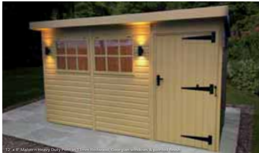
12' x 8' Malvern Heavy Duty Pent in 13mm Redwood, Georgian windows & painted finish