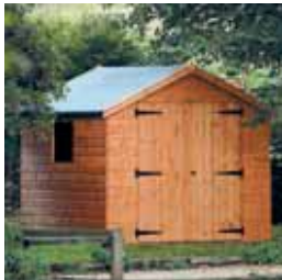
8' x 8' Bewdley Apex with optional double doors