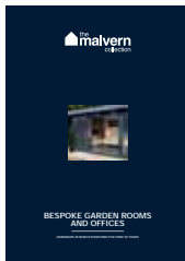
Bespoke Garden Rooms and Offices