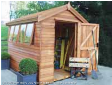
6' x 6' Malvern Heavy Duty Apex in cedar with cedar slatted roof