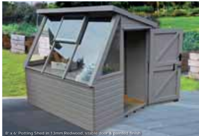
8' x 6' Potting Shed in 13mm Redwood, stable door & painted finish