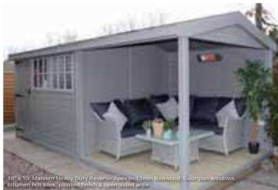
18' x 10' Malvern Heavy Duty Reverse Apex in 13mm Redwood, Georgian windows, bitumen felt tiles, painted finish & open sided area